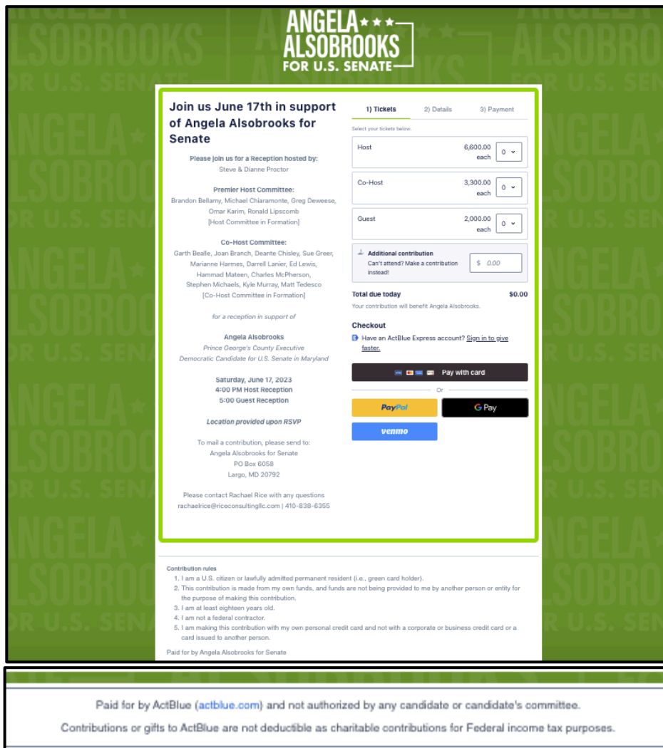
Angela Alsobrooks for U.S. Senate, Join Us June 17th in Support of Angela Alsobrooks for Senate, Angela Alsobrooks for U.S. Senate-ActBlue (June 17, 2023)