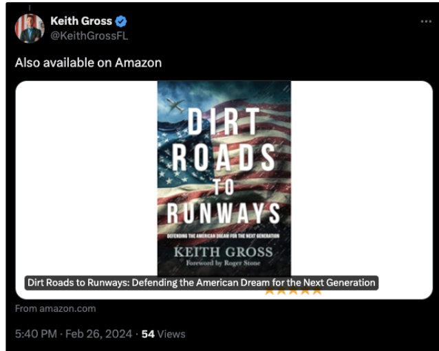
Keith Gross (@KeithGrossFL), X , (Feb. 26, 2024)