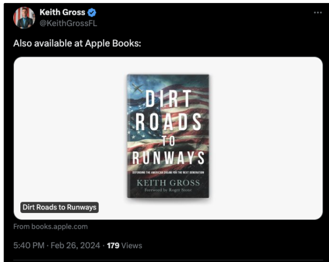
Keith Gross (@KeithGrossFL), X , (Feb. 26, 2024)